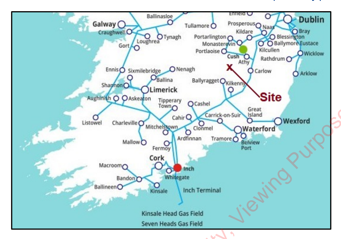
Figure 13.3 Bord Gais' Transmission and Distribution Gas Pipeline Network

Scale: Horizontal width of field = c. 350 km.